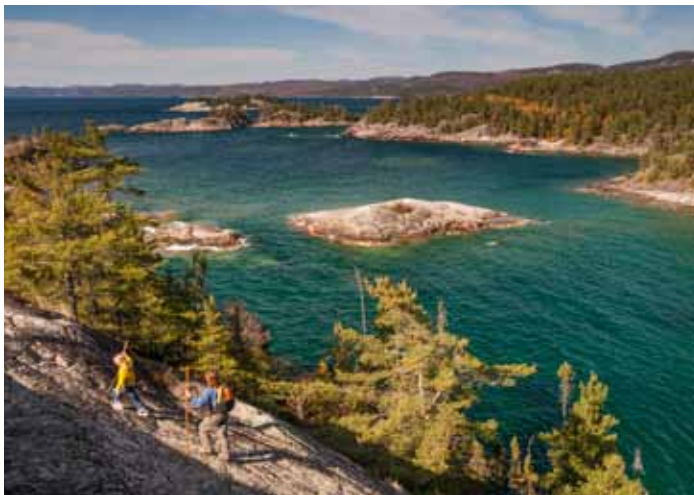
Hiking trails in parks and communities connect to the TCT LSWT access points.

It is a sustainable gift for future generations that inspires healthy living and active transportation. It preserves green space and promotes conservation, increases awareness of Canada's history, culture and natural heritage, stimulates tourism and creates jobs. The Lake Superior Water Trail (LSWT) is a link in the Trans Canada Trail (TCT) that has outstanding scenic beauty, wild natural landscapes and cultural values that provide amazing experiences.