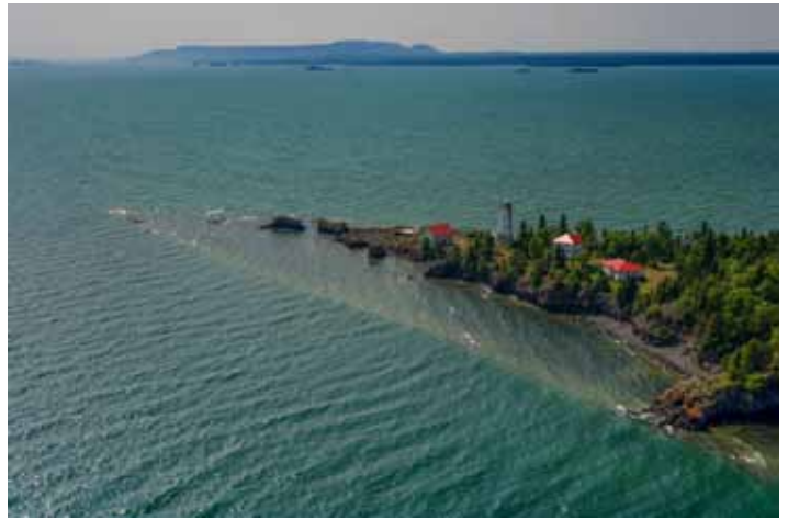
Porphyry Island Light House east of Thunder Bay's Sleeping Giant.

The TCT LSWT is being connected to American water trails around Lake Superior in Minnesota, Wisconsin, and Michigan. Together these trails form a unique bi-national system of water trails that revitalizes the ancient highway linking water, land and communities along the Lake Superior Heritage Coast. These trails create an “Appalachian Trail of water trails”. This waterway provides an opportunity to experience the earth’s greatest expanse of freshwater first-hand.