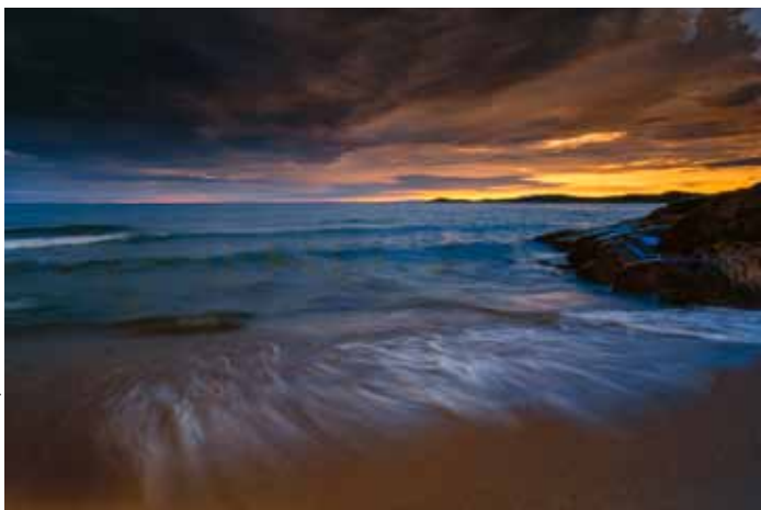
Where the Pic River meets Lake Superior, Pic River First Nation is rich in the cultural history of the heritage highway.