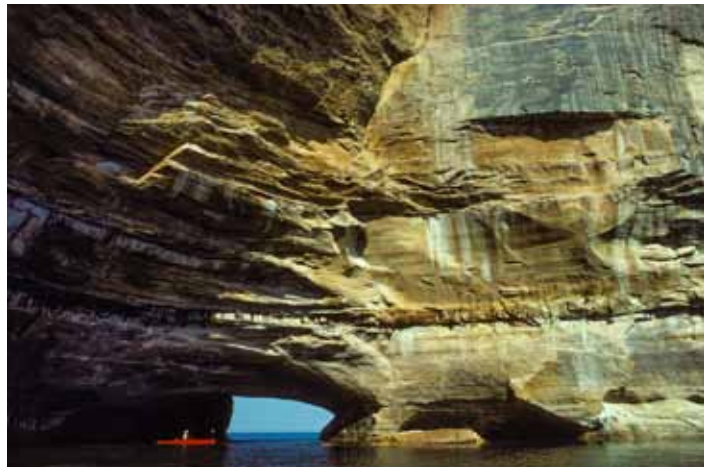
Padding past the Pictured Rocks National Lakeshore in the Lake Superior Water Trail in Michigan.