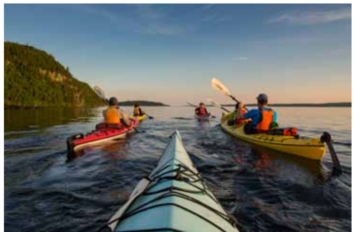
Experience paddling the earth's greatest expanse of freshwater.